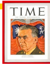
George C Marshall

Bottom Line = We are looking for high-performing, well-rounded Student/Athlete/Leaders that demonstrate excellent potential for success as a future leader