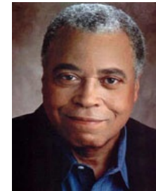
James Earl Jones

University of Missouri American Businessman Founder of Wal-Mart